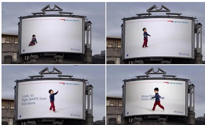
Figure 4.3 Example of a video billboard. The boy in the advertisement walks.

Gitelman et al. (2012) and Yannis et al. (2013) do not specify what type of billboards their studies covered. The studies of Smiley et al. (2005), Izadpanah et al. (2014), and Tantala and Tantala (2010) were about static digital billboards. In the study of Tantala and Tantala (2010) the exposure time of a single advertisement on the digital billboards was 10 seconds. In the studies of Izadpanah et al. (2014) and in Smiley et al. (2005) the exposure time of a single advertisement was not specified.