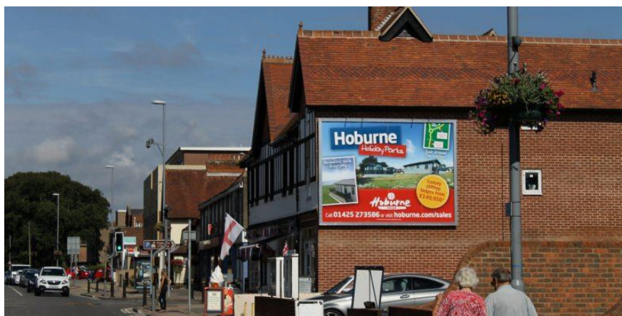
Figure 4.1 Example of a traditional static billboard.