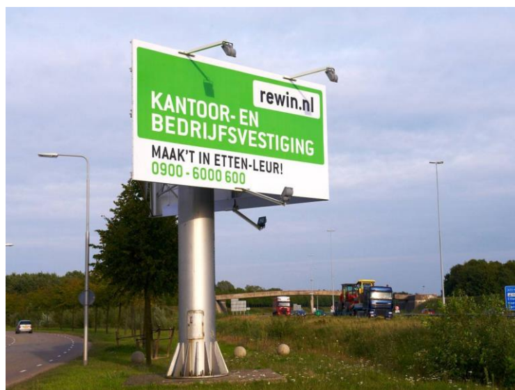
Figure 5.1 Example of three slowly rotating illuminated traditional static billboards that are placed on a pillar.

Fast moving objects grab the attention but very slow rotating objects probably not so much. However, no studies were found regarding this topic.