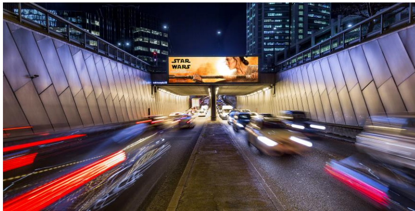
Figure 4.2 Example of a static digital billboard. The large LED screen emits light but while an advertisement is displayed on the screen for a couple of seconds nothing moves in the advertisement.